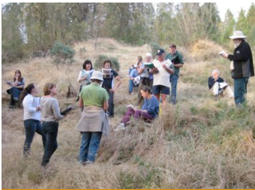
Riparian Assessment Training

Ph 62783309 waterwatch@ginninderralandcare.org.au www.ginninderralandcare.org.au