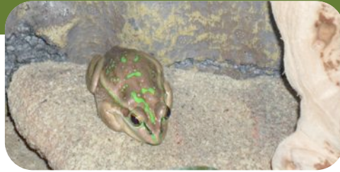
Green and Golden Bell frog

The Ginninderra Catchment Group Frogwatch program is an ACT & Region community science and education initiative stretching from Yass to Cooma and everywhere in between.