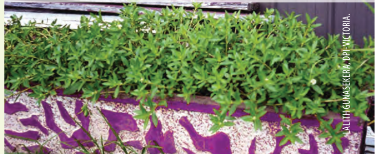
Alligator weed can be grown in backyards by mistake