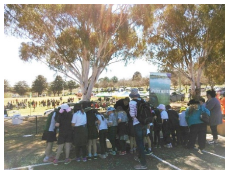
Students enjoying a Waterwatch education session.